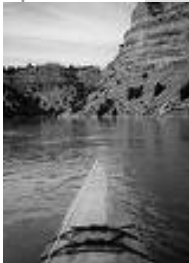
Boating on Glendo

The Wyo-Braska Area "Unity Days" is entering its 17th year of fun and fellowship. This festive campout is a great opportunity for addicts in recovery to join together and enjoy the great outdoors.